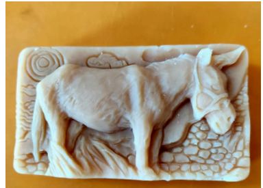
Our original Donkey Soap