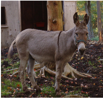
Zeus, our real donkey.